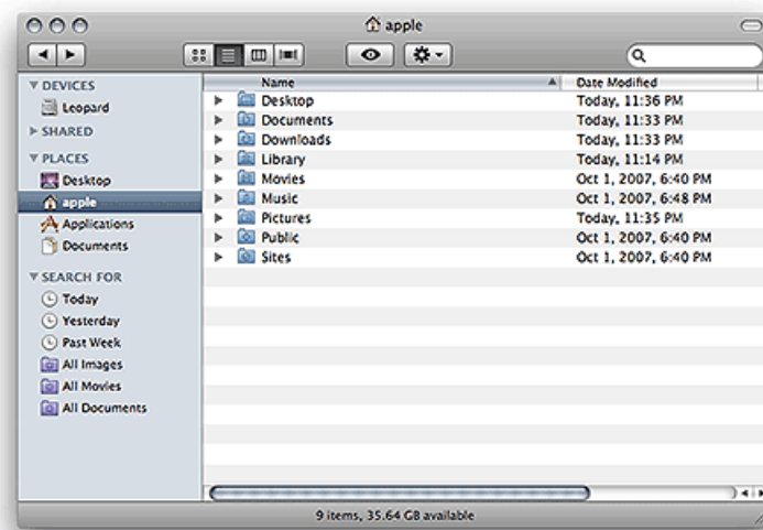
List view allows you to see more information about a selected folder's or volume's contents.

If you'd like to change how folder and volume contents appear in the right pane, click one of the view buttons in the toolbar. The Finder window, by default, displays contents in icons view. If you'd like to see more information about the contents in a selected folder or volume, click the list view button.